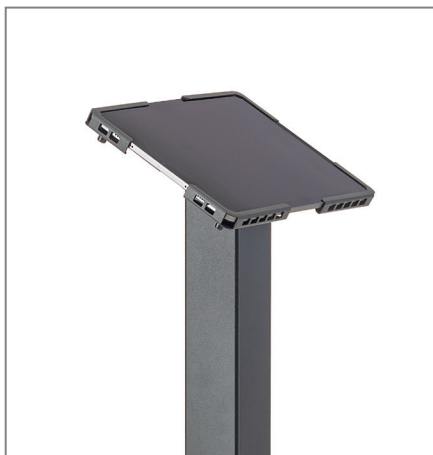
Sample illustration incl. HA Tablet Case

The surfaces are provided with a high quality surface finish. The standard color is black (RAL 9005), but other RAL colors are possible on request.