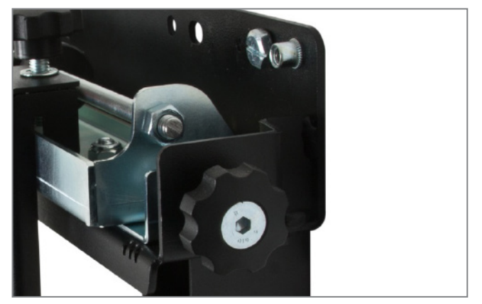
8-point levelling, no tools needed