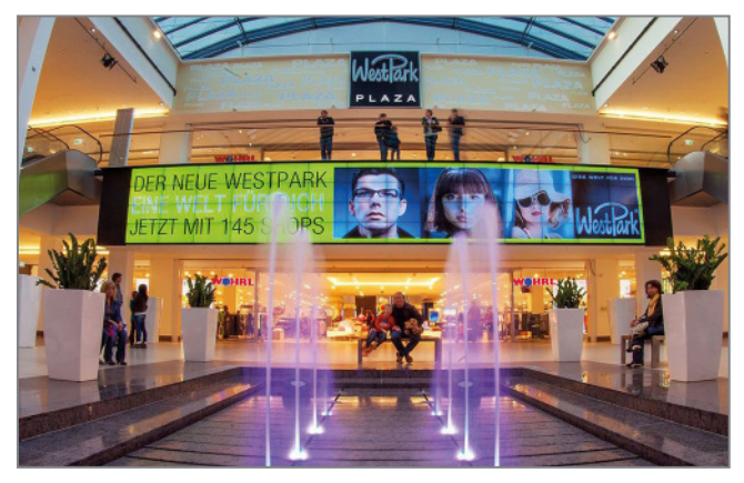
Installation example at shopping mall "Westpark Ingolstadt"

Technical changes reserved | This document is the property of HAGOR Products GmbH. Forwarding and duplication of this document, utilization and communication of its contents are not permitted unless expressly permitted. A violation obliges you to pay compensation. All rights reserved in the event of a patent, utility model or design registration.