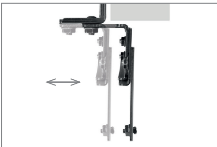
Depth continuously adjustable (Tool needed)