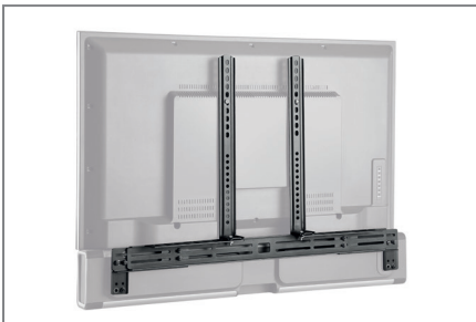
Installation possible above or beneath the screen