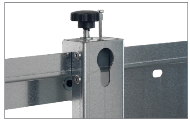
quick and easy adjustment