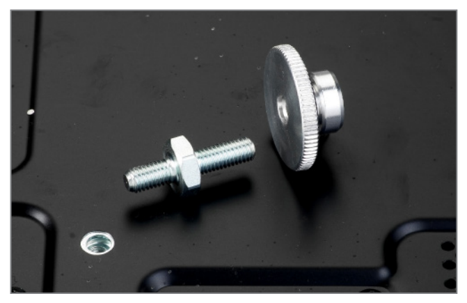
stable screw connection

Video wall multiple frame for quick installation