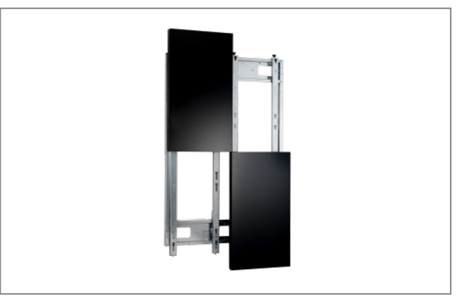
portrait installation (2x2 in this example)