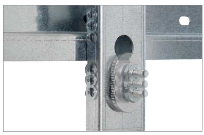
Height adjustable via hand-adjustable knurled-head screws