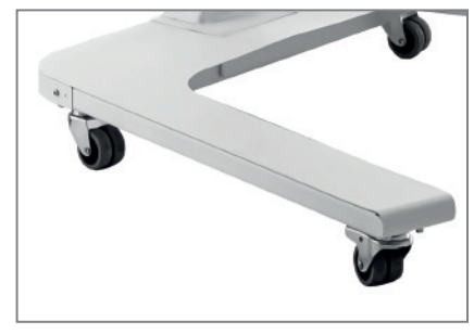
incl. castor set, partially lockable