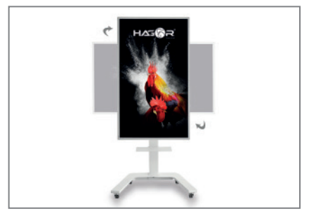
change the format without unlocking