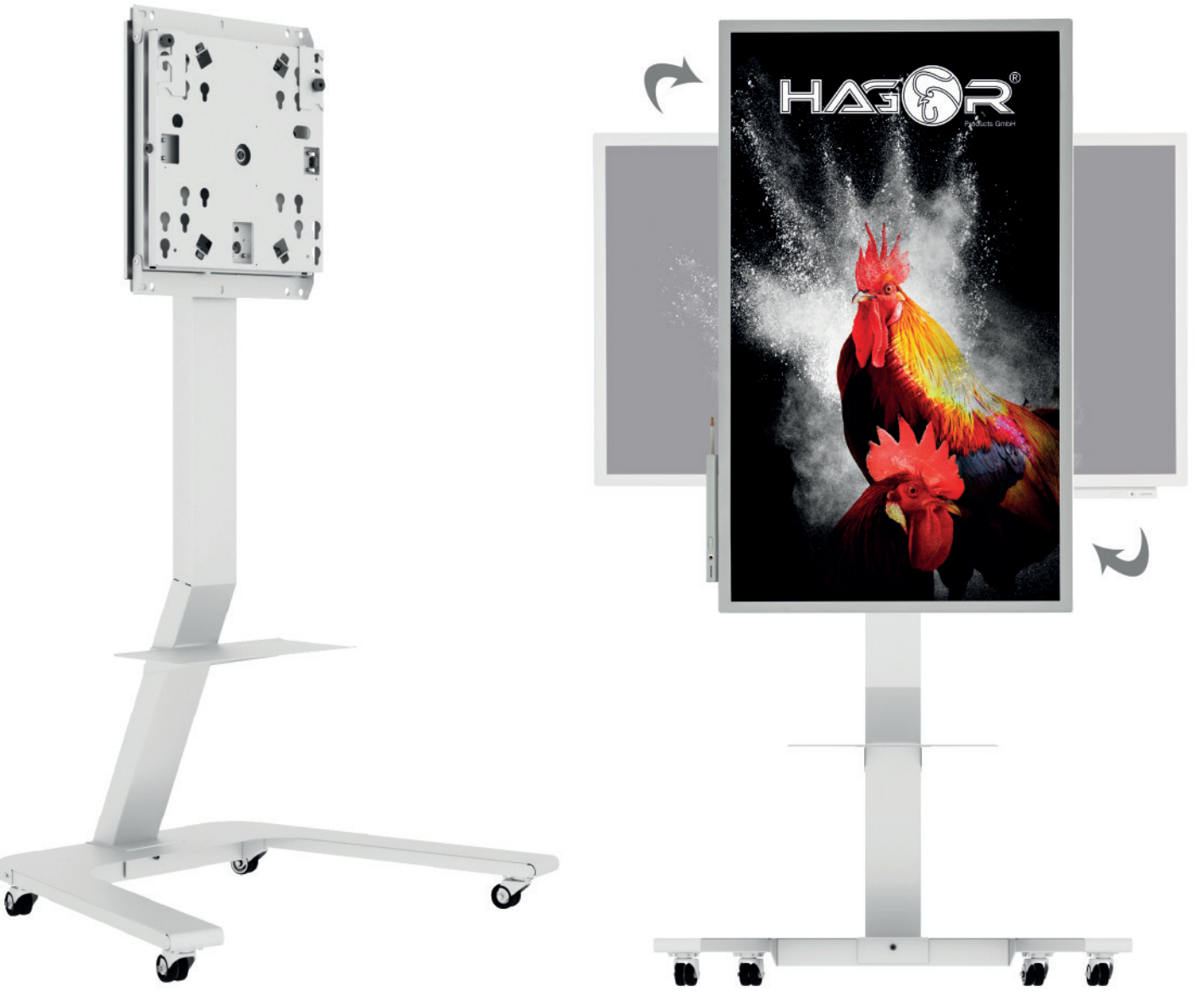
Technical changes reserved | This document is the property of HAGOR Products GmbH. Forwarding and duplication of this document, utilization and communication of its contents are not permitted unless expressly permitted. A violation obliges you to pay compensation. All rights reserved in the event of a patent, utility model or design registration.

The included shelf can be used optionally and can be mounted in 2 positions. It offers a practical storage place below the Samsung Flip.