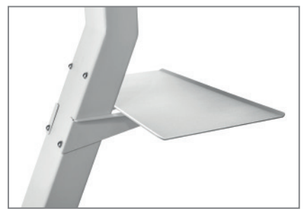
incl. shelf, optionally usable