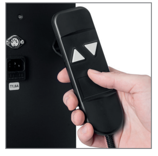
wired touch control

Technical changes reserved | This document is the property of HAGOR Products GmbH. Forwarding and duplication of this document, utilization and communication of its contents are not permitted unless expressly permitted. A violation obliges you to pay compensation. All rights reserved in the event of a patent, utility model or design registration.