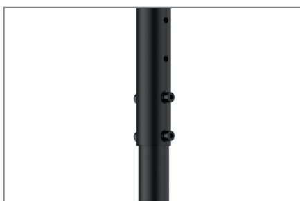
telescopic up to max. 3000 mm