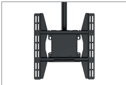
max. VESA 400 x 400 mm