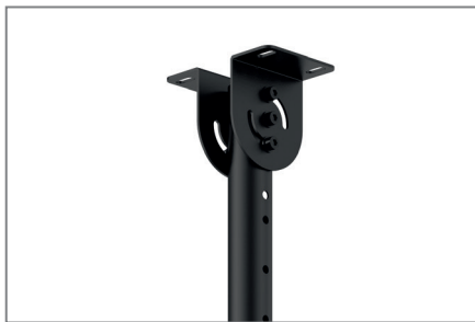
tilting module, continuous, 0 - 90°