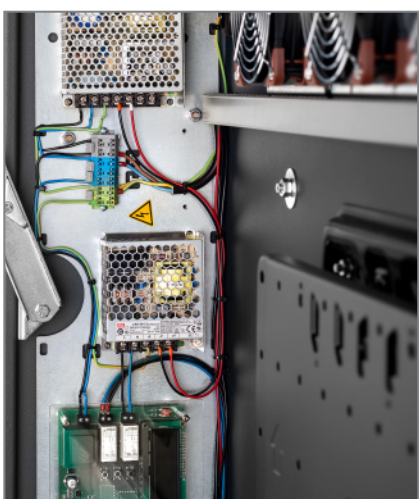
Cabling according to VDE guidelines