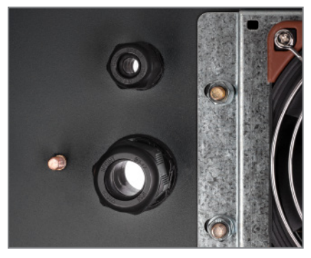
Cable entries with seal