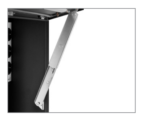
stable fixing mechanism