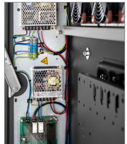
Cabling according to VDE guidelines