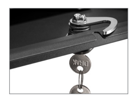
can be locked with 2 locks (included)