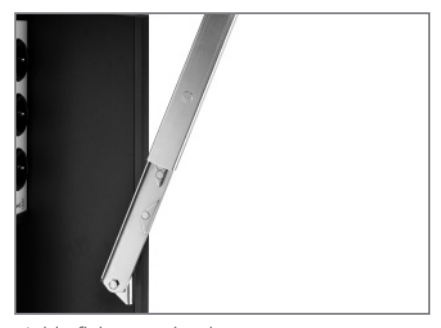
stable fixing mechanism