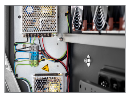
Cabling according to VDE guidelines