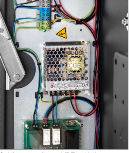
Cabling according to VDE guidelines