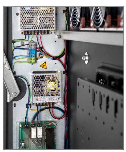
Cabling according to VDE guidelines