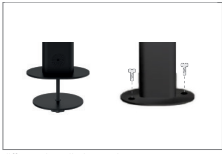
different installation options

The surface of the HA Flex-Lock Tabletstand is finished with an impact- and scratch-resistant powder coating in black, which makes the surface very carefree.