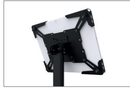
fully moveable and flexibly adjustable