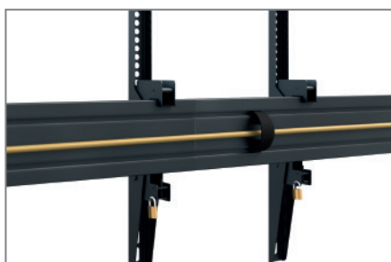
Cable management by cable clips