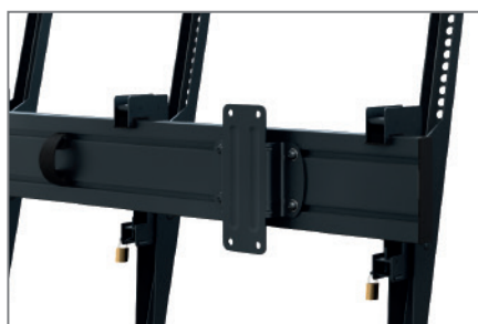
Adaptable thanks to modular design