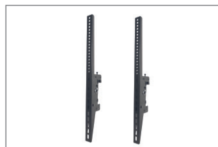
VESA max. 400 x 600 mm