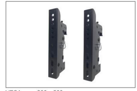
VESA max. 200 x 200 mm

Technical changes reserved | This document is the property of HAGOR Products GmbH. Forwarding and duplication of this document, utilization and communication of its contents are not permitted unless expressly permitted. A violation obliges you to pay compensation. All rights reserved in the event of a patent, utility model or design registration.