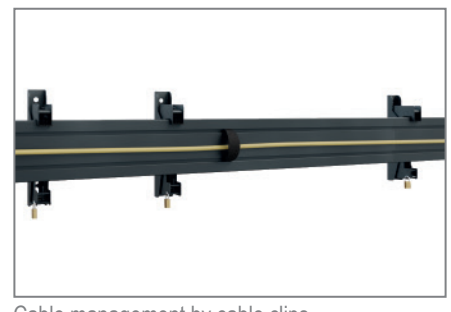
Cable management by cable clips

echnical changes reserved | As of: 02/2022