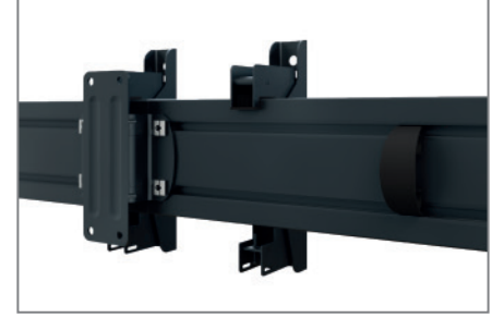
Adaptable thanks to modular design

echnical changes reserved | As of: 02/2022