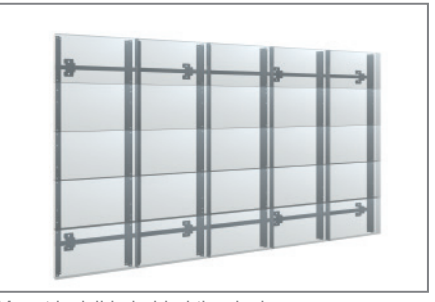
Mount invisible behind the devices