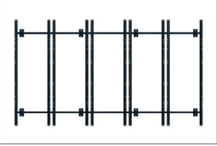
8 wall mounting points for stable support