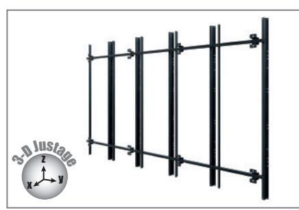
Fine adjustment possible on three axes