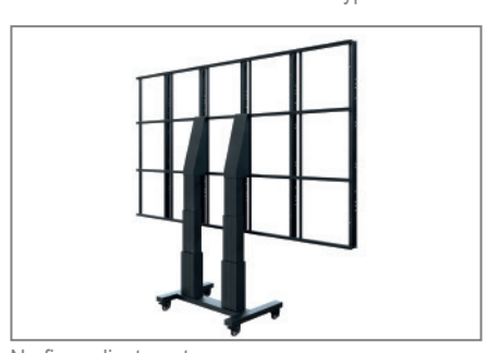
No fine adjustment necessary