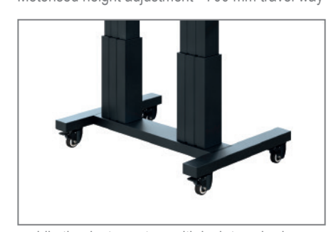
mobile thanks to castors with lock-type brake