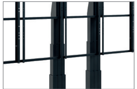
Motorised height adjustment - 700 mm travel way

In addition to the pre-configured systems, HAGOR offers customised special solutions in the LED sector, which can be individualised with accessories such as loudspeakers, controls and so on to meet all requirements.