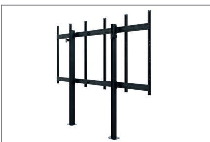
Low space requirement thanks to floor-wall mounting