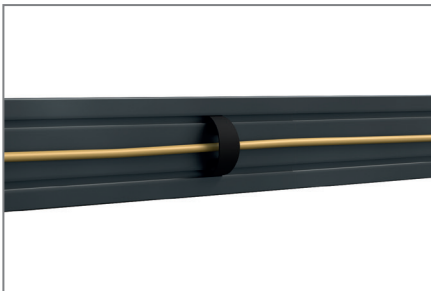
Cable routing with clips

In addition to the pre-configured systems, HAGOR offers customised special solutions in the LED sector, which can be individualised with accessories such as loudspeakers, controls and so on to meet all requirements.