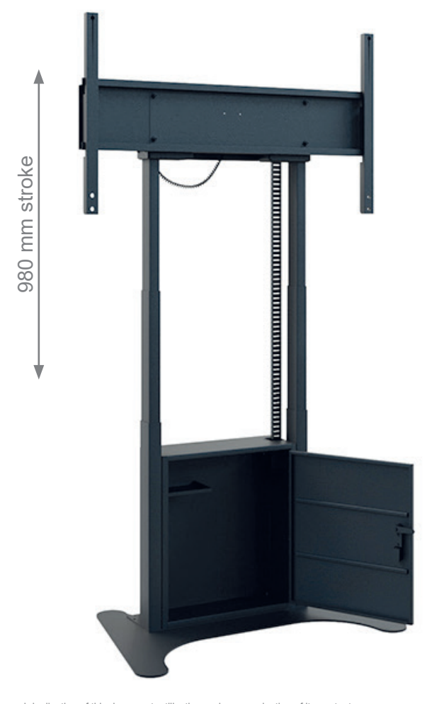
Technical changes reserved | This document is the property of HAGOR Products GmbH. Forwarding and duplication of this document, utilization and communication of its contents are not permitted unless expressly permitted. A violation obliges you to pay compensation. All rights reserved in the event of a patent, utility model or design registration.