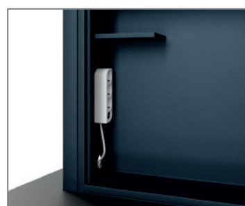
Lockable media cabinet