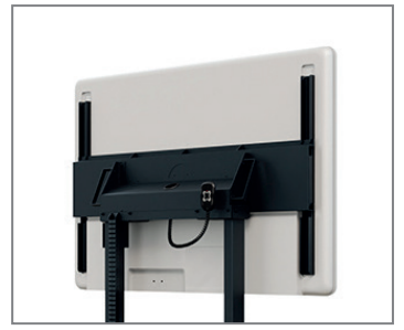
Hole pattern display-specific optimised