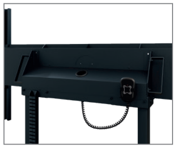
Cable management via cable drag chain