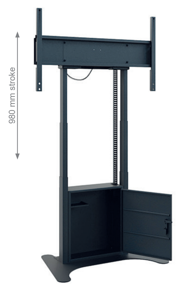
Technical changes reserved | This document is the property of HAGOR Products GmbH. Forwarding and duplication of this document, utilization and communication of its contents are not permitted unless expressly permitted. A violation obliges you to pay compensation. All rights reserved in the event of a patent, utility model or design registration.