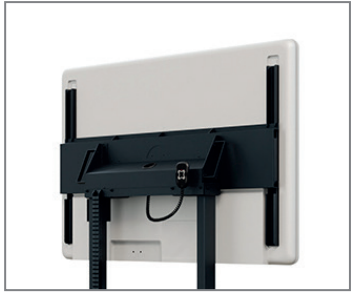
Hole pattern display-specific optimised