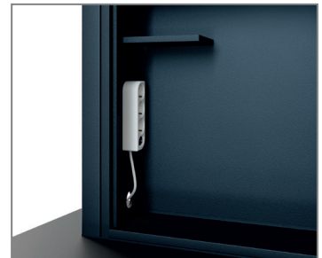
Lockable media cabinet