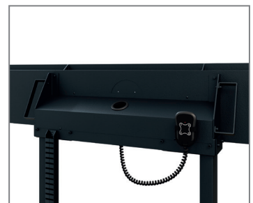
Cable management via cable drag chain

Technical changes reserved | This document is the property of HAGOR Products GmbH. Forwarding and duplication of this document, utilization and communication of its contents are not permitted unless expressly permitted. A violation obliges you to pay compensation. All rights reserved in the event of a patent, utility model or design registration.