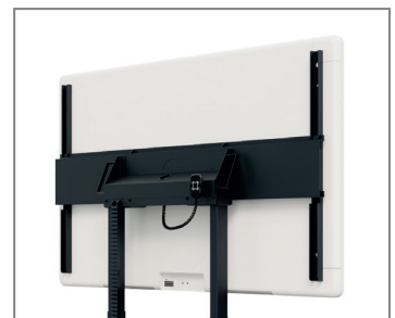
Hole pattern display-specific optimised