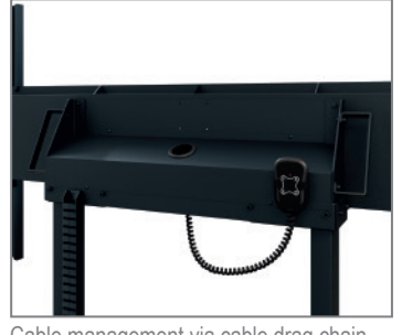
Cable management via cable drag chain