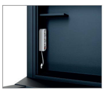
Lockable media cabinet