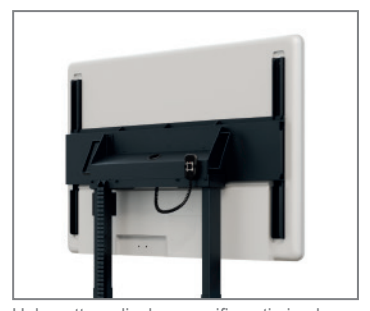
Hole pattern display-specific optimised