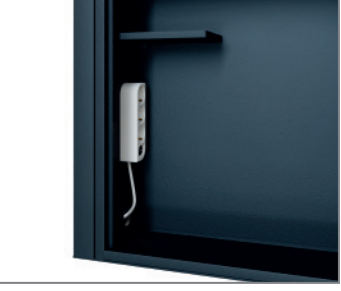
Lockable media cabinet