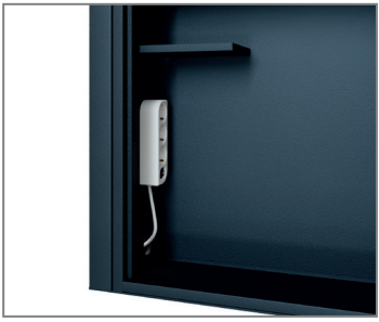
Lockable media cabinet