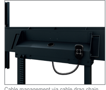
Cable management via cable drag chain