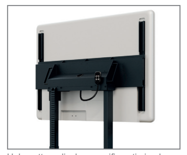
Hole pattern display-specific optimised