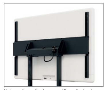
Hole pattern display-specific optimised