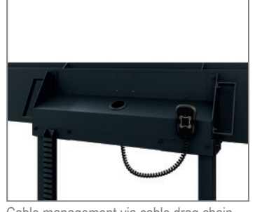
Cable management via cable drag chain