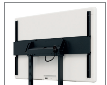
Hole pattern display-specific optimised