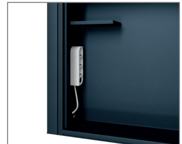
Lockable media cabinet