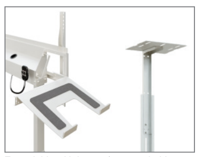
Extendable with laptop / camera holder

Technical changes reserved | This document is the property of HAGOR Products GmbH. Forwarding and duplication of this document, utilization and communication of its contents are not permitted unless expressly permitted. A violation obliges you to pay compensation. All rights reserved in the event of a patent, utility model or design registration.