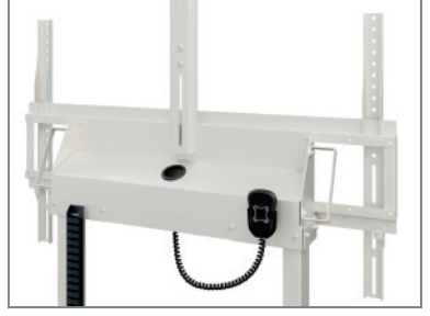
Cable management via cable drag chain