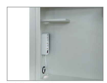
Lockable media cabinet