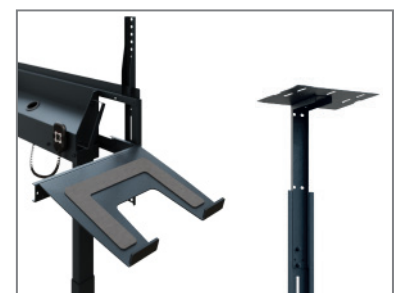
Extendable with laptop / camera holder