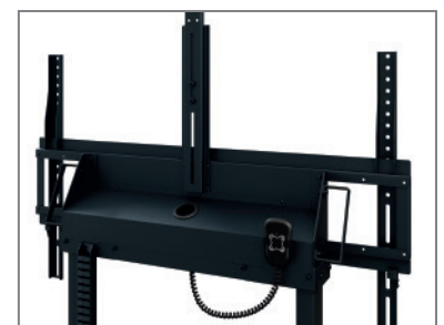
Cable management via cable drag chain