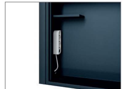
Lockable media cabinet