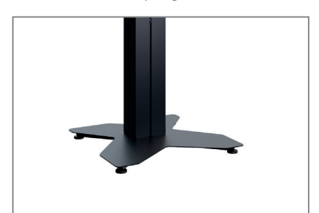
tilt proof baseplate with levelling feet