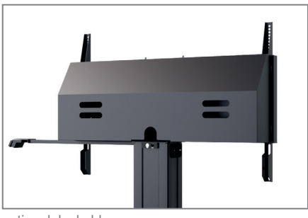
optional: lockable cover