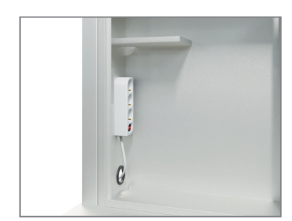
Media cabinet with plug bar and shelf