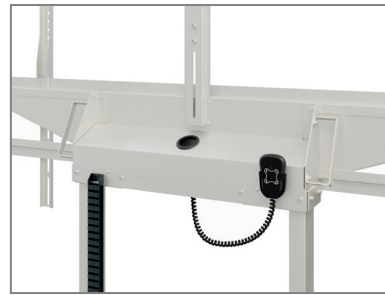
Cable management via cable drag chain