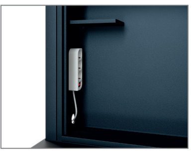
Media cabinet with plug bar and shelf