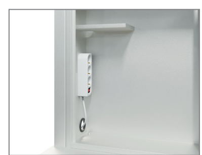
Media cabinet with plug bar and shelf