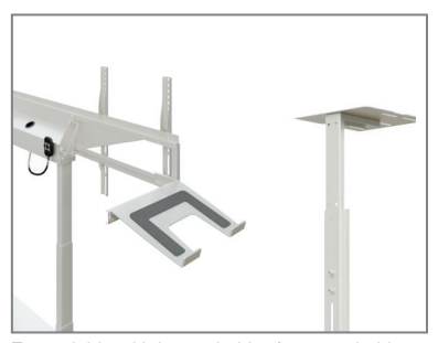
Expandable with laptop holder / camera holder

Technical changes reserved | This document is the property of HAGOR Products GmbH. Forwarding and duplication of this document, utilization and communication of its contents are not permitted unless expressly permitted. A violation obliges you to pay compensation. All rights reserved in the event of a patent, utility model or design registration.