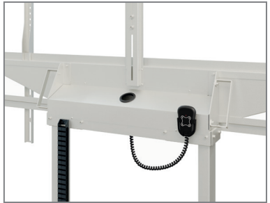
Cable management via cable drag chain