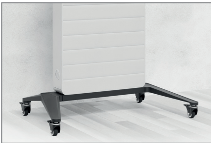
Mobile thanks to castors with locking brake