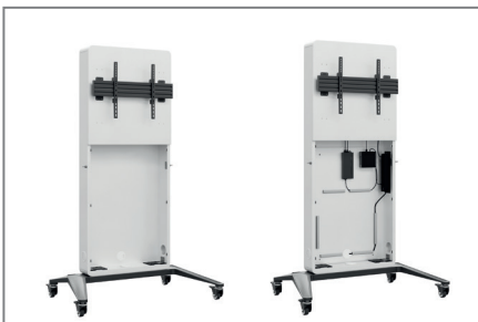
Accessories are protected inside the corpus