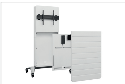
Easy assembly thanks to removable AV mounting plate