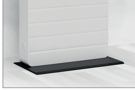
Tilt proof base plate