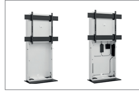
Accessories are protected inside the corpus