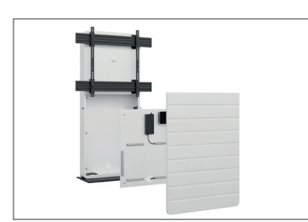
Easy assembly thanks to removable AV mounting plate