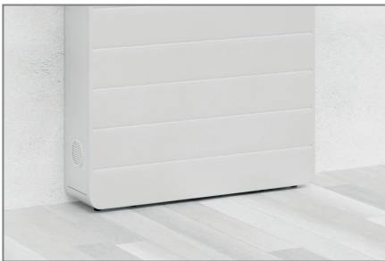
Levelling feet under the corpus provide level compensation