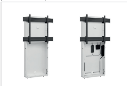
Accessories are protected inside the corpus