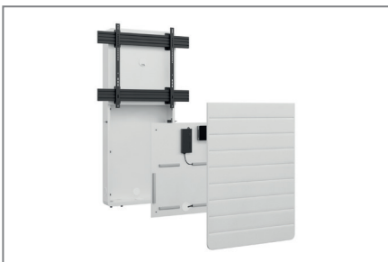
Easy assembly thanks to removable AV mounting plate