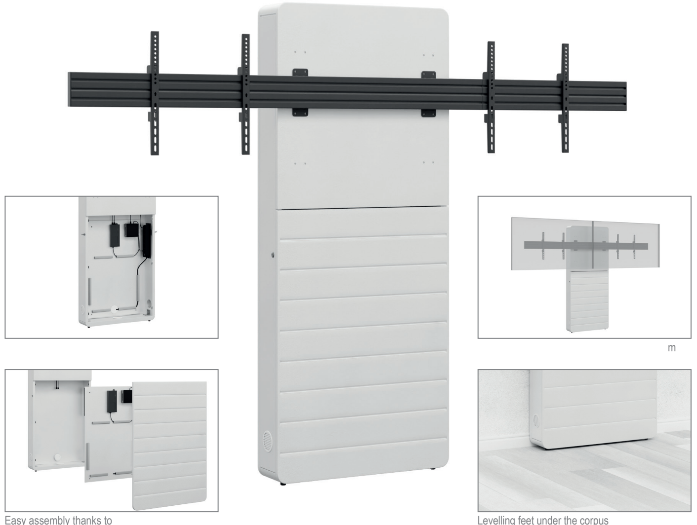
Easy assembly thanks to removable AV mounting plate

Technical changes reserved | This document is the property of HAGOR Products GmbH. Forwarding and duplication of this document, utilization and communication of its contents are not permitted unless expressly permitted. A violation obliges you to pay compensation. All rights reserved in the event of a patent, utility model or design registration.