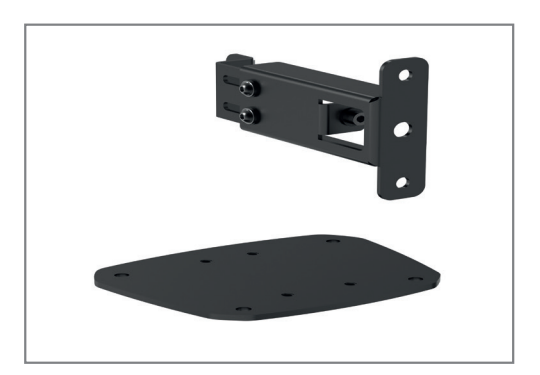
Space saving floor-wall mounting