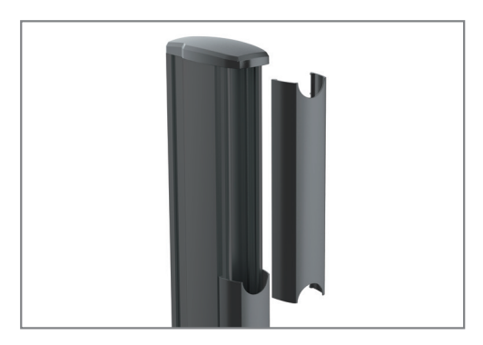
Concealed cable routing