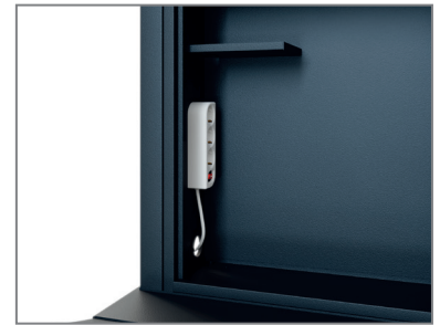
Lockable media cabinet