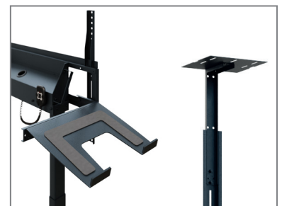
Extendable with laptop / camera holder