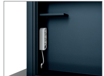
Lockable media cabinet