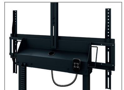
Cable management via cable drag chain