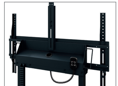
Cable management via cable drag chain