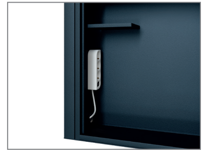
Lockable media cabinet