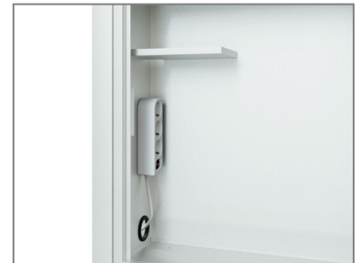
Lockable media cabinet