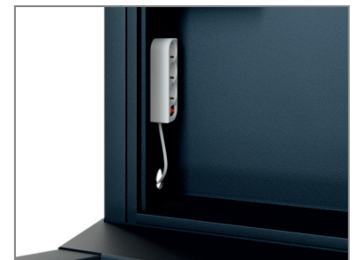
Cable management via cable drag chain