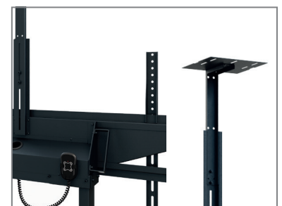
Expandable with laptop holder / camera holder