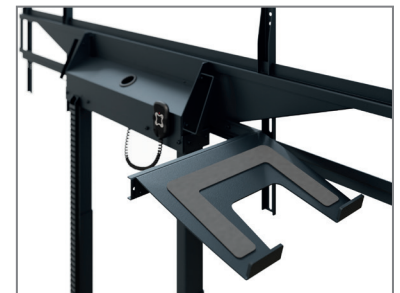
Media cabinet with plug bar and shelf