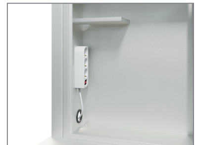
Media cabinet with plug bar and shelf