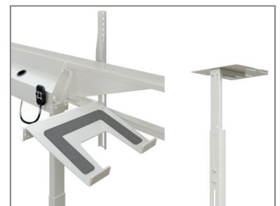
Expandable with laptop holder / camera holder