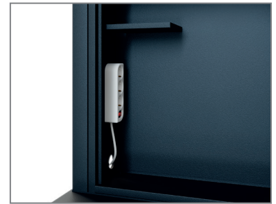
Media cabinet with plug bar and shelf