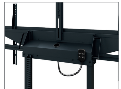
Cable management via cable drag chain