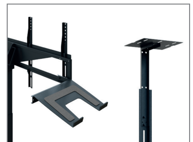
Expandable with laptop holder / camera holder