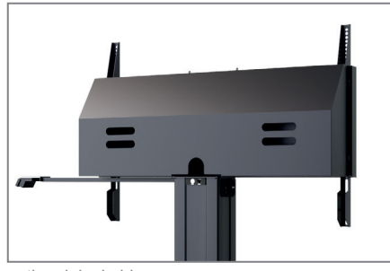
optional: lockable cover