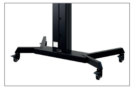
Heavy duty castors with locking brake