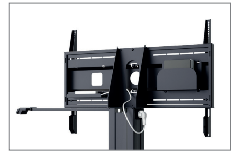
Incl. shelfs for Mini-PC | Plug bar