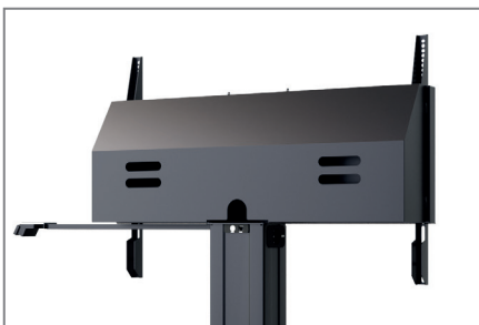
optional: lockable cover