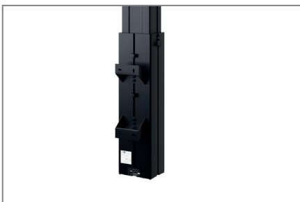
space saving floor-wall installation