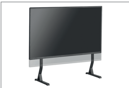
Can be mounted in 3 different heights