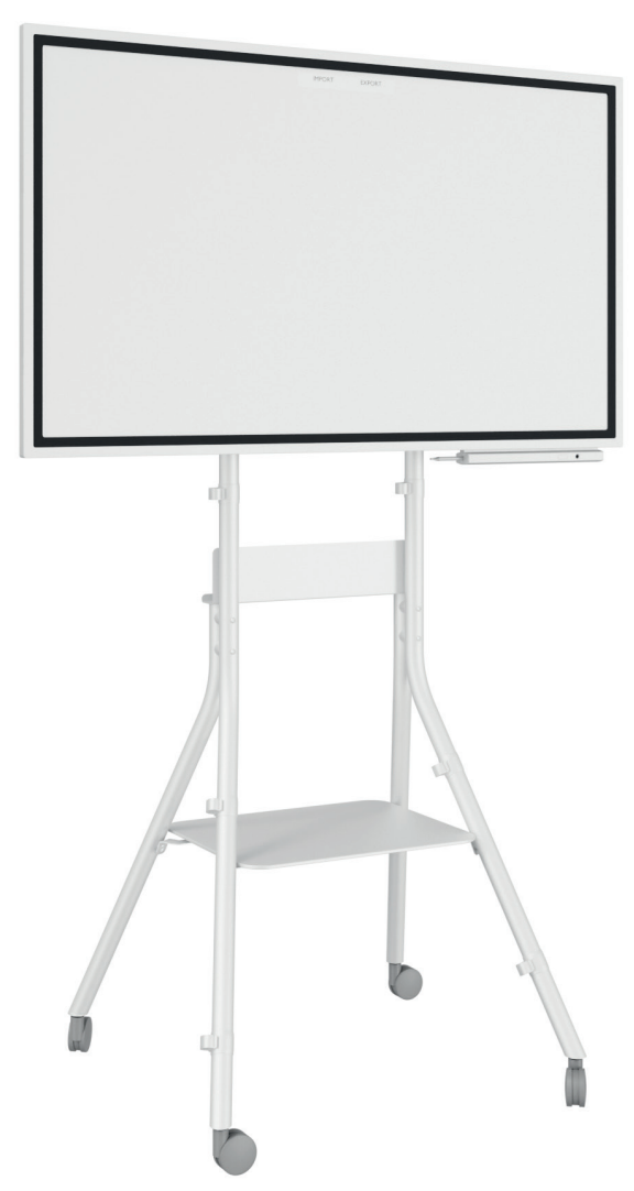
Samsung Flip not included. | Technical changes reserved | This document is the property of HAGOR Products GmbH. Forwarding and duplication of this document, utilization and communication of its contents are not permitted unless expressly permitted. A violation obliges you to pay compensation. All rights reserved in the event of a patent, utility model or design registration.