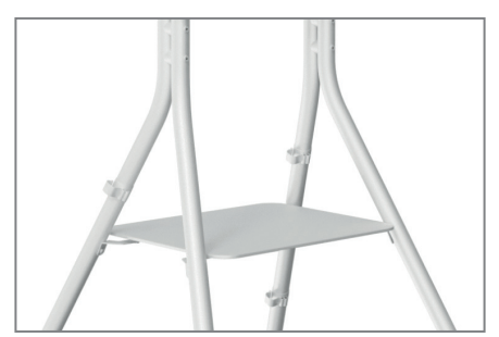
AV glass shelf included