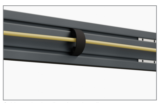
Cable routing by clips along the rails

The complete solutions can be combined and extended with the components of the comPROnents® series without restriction and thus offer further application possibilities.