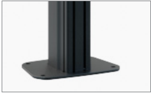
Space saving floor-wall mounting