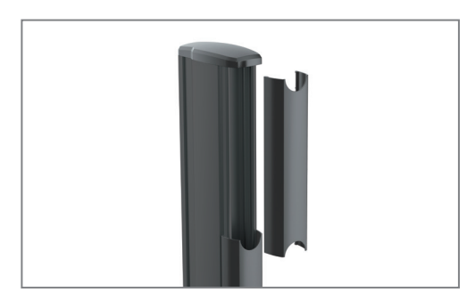
Hidden cable routing along the pillars