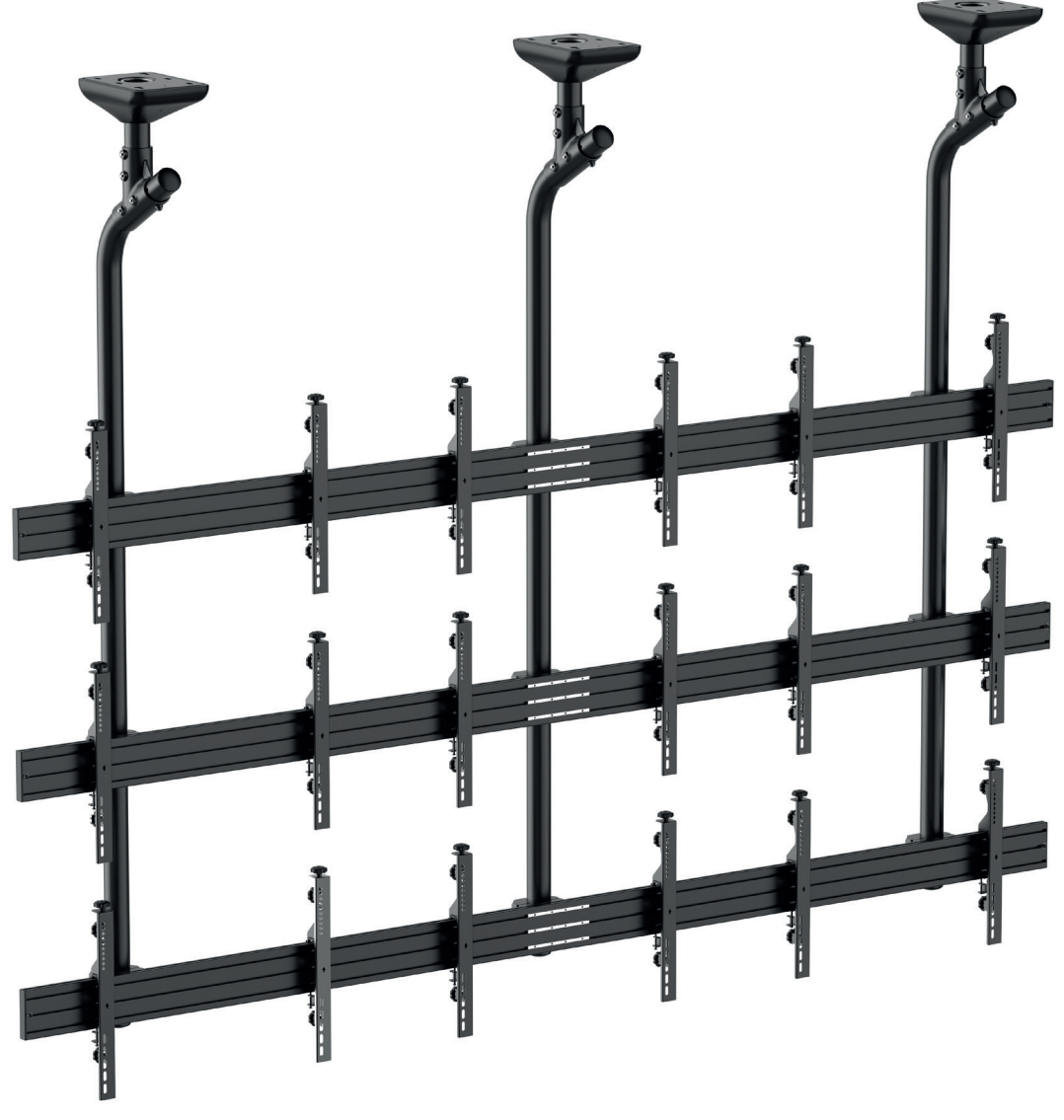
Technical changes reserved | This document is the property of HAGOR Products GmbH. Forwarding and duplication of this document, utilization and communication of its contents are not permitted unless expressly permitted. A violation obliges you to pay compensation. All rights reserved in the event of a patent, utility model or design registration.

The complete solutions can be combined and extended with the components of the comPROnents® series without restriction and thus offer further application possibilities.